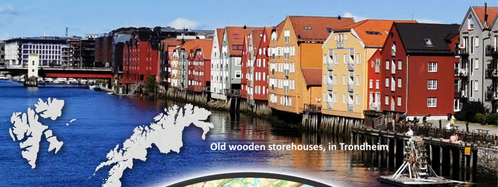
Old wooden storehouses, in Trondheim