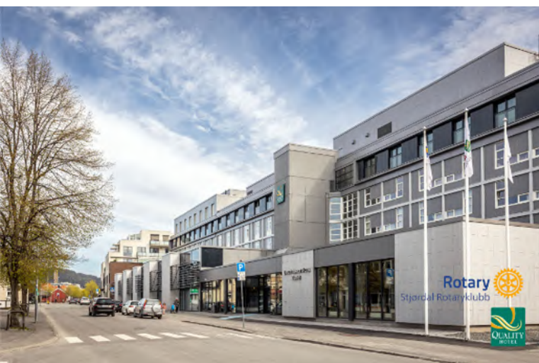
Quality Airport Hotel - Accommodation in Stjørdal