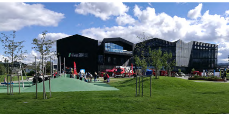
KIMEN, "The SEED" - Stjørdal cultural center